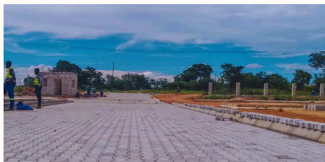
View facing Livingstone Road, Southern Province, Zambia, showing paving, entrance security office (left), and campus fence construction (right)

With each day, our vision is becoming more tangible. The transformation is evident, and we are deeply grateful for the support that has made this progress possible. As we wrap up February, we look ahead with anticipation, knowing that every step forward brings us closer to a campus that will inspire and equip future generations.