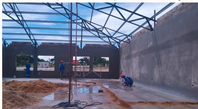
Plastering work underway.